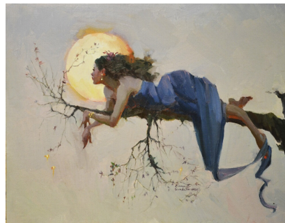
Nancy Seamons Crookston

Visit these links for information on upcoming events: