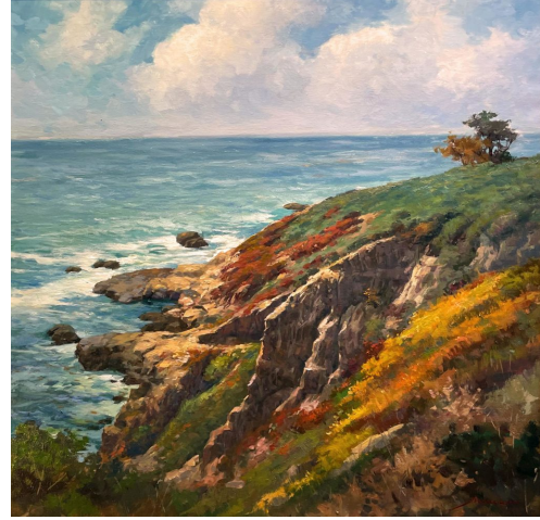
Junn Roca Beyond Carmel

Note: The gallery is temporarily open only on weekends from 11 a.m. to 2 p.m.