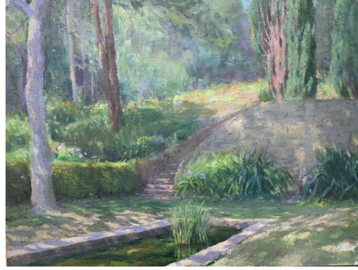
Ernesto Nemesio Blake Garden

The exhibition will feature paintings showcasing images of the lush gardens throughout California.