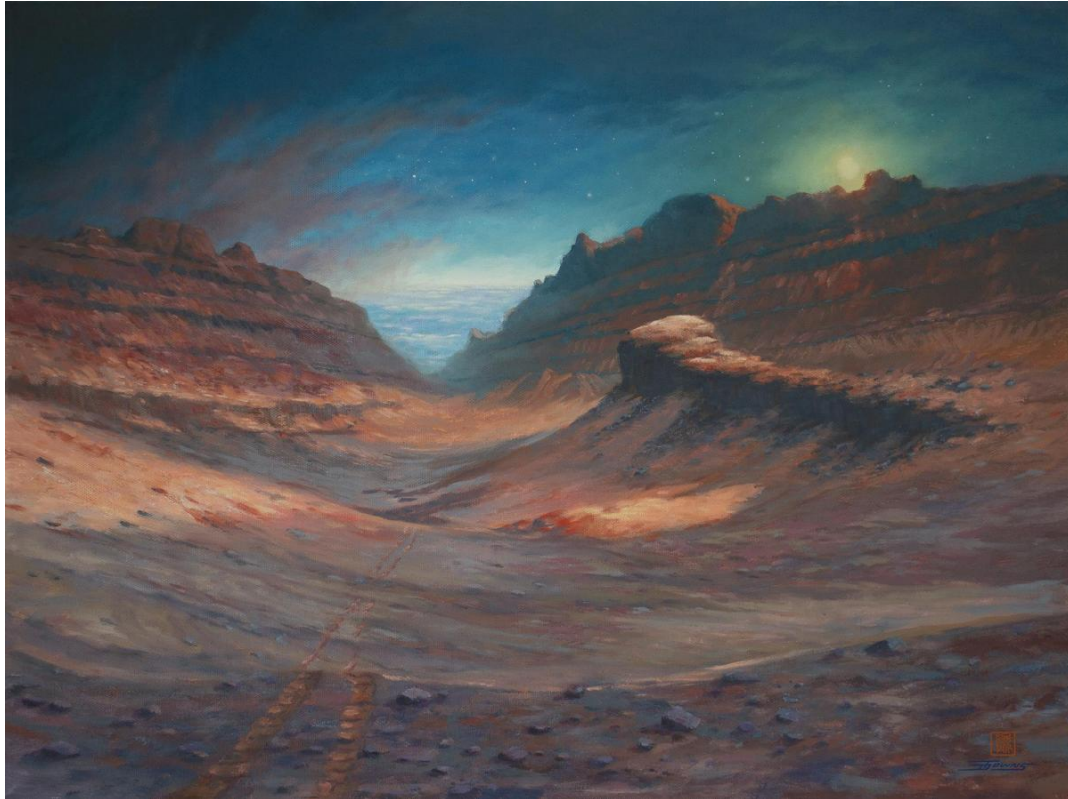
Donald Towns Barren Beauty Oil, 18" x 24"