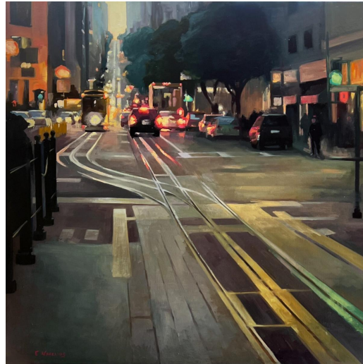
Erica Norelius Cable Car Tracks, California Street, SF

Iconic California showcases the enviable California lifestyle as it explores the enigmatic beauty of the Golden State. The display features members of the San Francisco and Monterey Bay chapters as well as Signature Sculptor members.