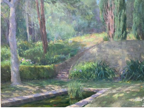
Ernesto Nemesio Blake Garden