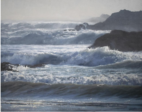
Rebecca Arguello Breakers at Indian Beach Winner: Second Place